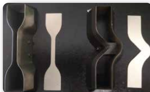
Dog-bone sample used to test on Instron