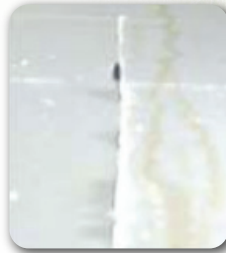
3.6% XM-B301 on epoxy solids