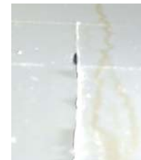
3 % K-FLEX XM-B301 On Total Formulation