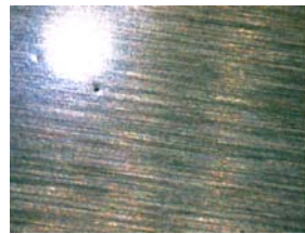
3% K-FLEX XM-B301 on Total Formulation